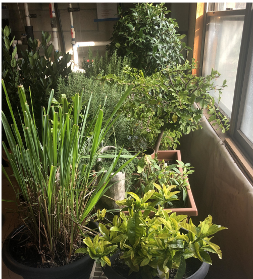
View of my plants near the basement window

Bay plant is an excellent choice to grow indoors in cold winter months. It is a woody shrub that should be cut back \frac{1}{3} to \frac{1}{2} before bringing indoors. Imagine whenever you want to flavor a stock or soup pot you can just pick your own fresh bay – it doesn't get any better than that! Occasionally scale might appear but it is easily controlled with a commercial insecticidal soap. Spray the top and bottom side of the leaves, three days apart, for three applications.