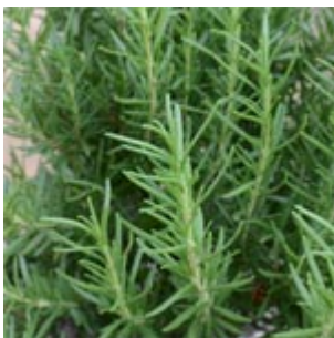
Shady Acres rosemary

Typically it is not a good idea nor recommended to grow basil indoors during the winter months. The short days with limited sunlight are not at all what basil requires but I am giving it a try with an established Mrihani basil and I hope for the best. Stay tuned for my results.